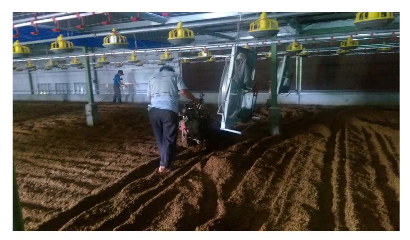
Image 1. Using a tiller to turn broiler chicken manure and bedding materials to ensure even application of PROGREEN-FM