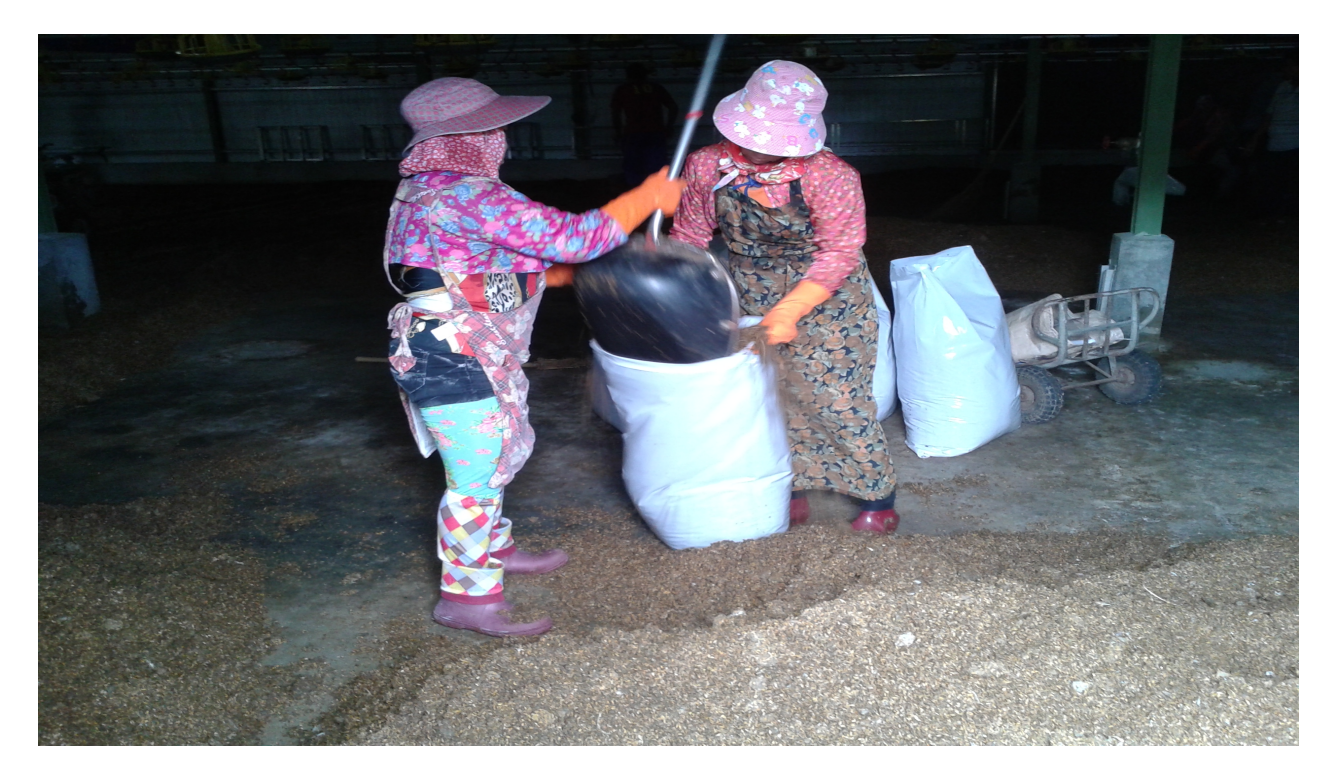
Image 3. Manually packing treated broiler chicken manure into NWP-assigned bulk bags