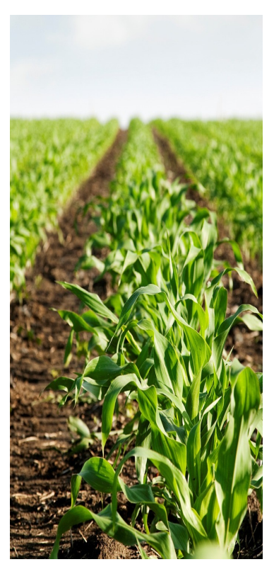
The composting of chicken manure can convert unstable material to a well-stabilized, humified substance (Warman and Cooper, 2010).